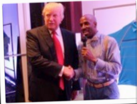
President Donald Trump