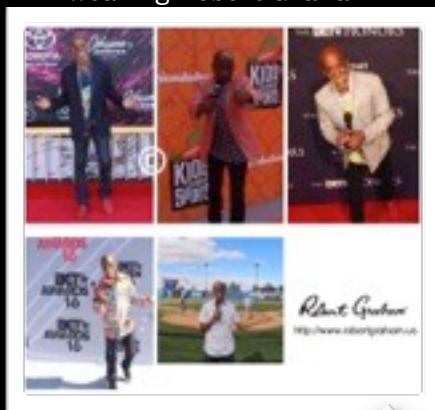
wearing Robert Graham