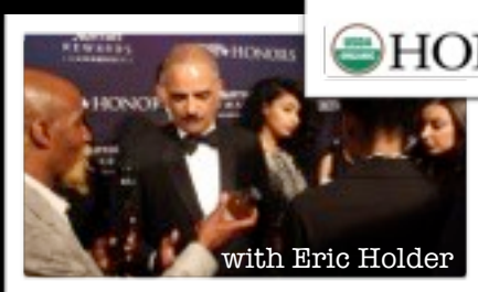
with Eric Holder